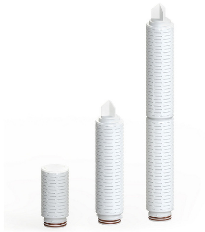
Air and gas filters.

Provides high quality for sterility assurance